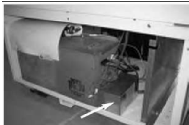
Battery location (above)

Locate the battery on the right side of the relay enclosure below.