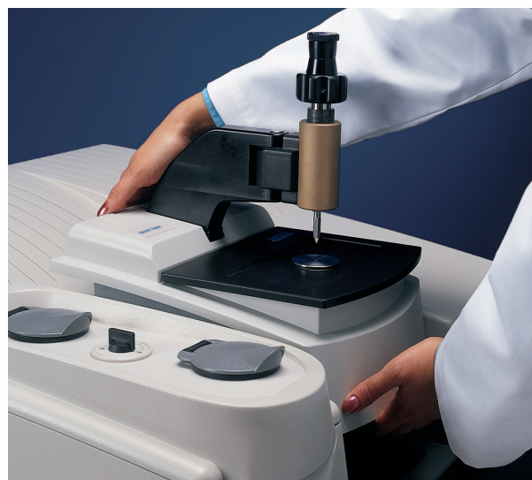
Figure 1: Smart Orbit diamond ATR accessory

Attenuated total reflection (ATR) is now the most common sampling technique in FT-IR spectroscopy. The profusion of ATR accessories on the market today attests to the utility of the technique. Each accessory is designed to achieve optimum performance with a particular sample type. Diamond ATR devices, such as the Thermo Scientific Smart Orbit accessory, are highly suitable for hard or corrosive samples, whereas a germanium accessory is preferred for highly absorbing materials. The development of these accessories has greatly simplified sampling for FT-IR spectroscopy. However, ATR does present some challenges. An infrared spectrum of a sample obtained using an ATR accessory is not identical to the spectrum obtained by transmission. The ATR technique introduces relative shifts in band intensity and absolute shifts in frequency. The relative intensity shift is well-known and is readily corrected. The shift in frequency, which can result in a displacement of the peak maximum by several wavenumbers, is at once more serious and yet less often accounted for. As most commercially available spectral libraries and published peak tables contain and refer to transmission spectra, differences between ATR and transmission spectra can lead to poor spectral search results and ambiguous interpretation. This technical note explains the reasons for these differences and demonstrates a technique for their correction.