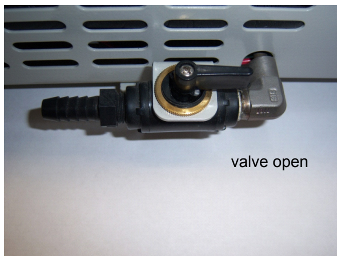
Figure 6. Drain valve open

The following pictures show the drain valve open and closed: