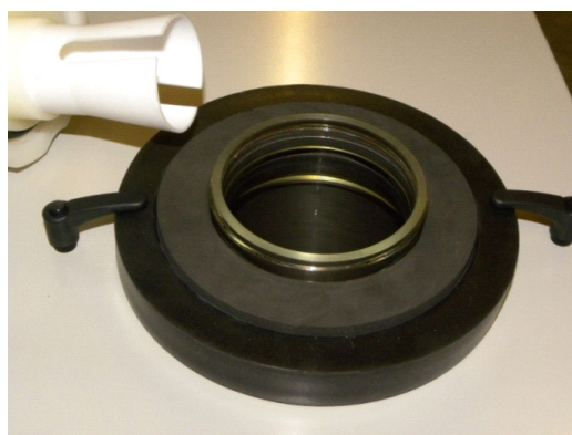
Figure 4. GF4000 locked down with retaining clips