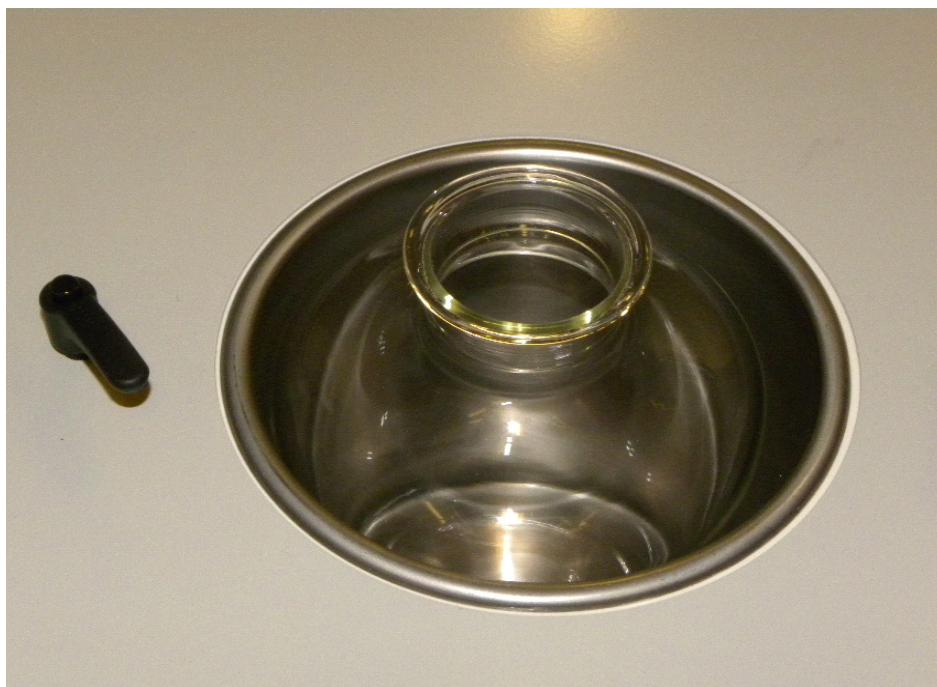
Figure 1. GCF400 in RVT5105 chamber

The figure below shows the GCF400 installation in the RVT5105 chamber. To the left is an insulation “lift and turn” retaining clip.