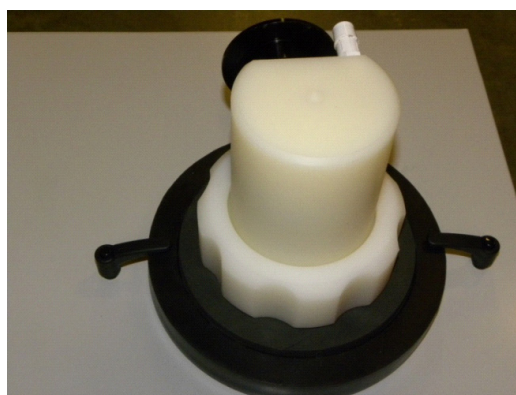
Figure 5. GF4000 with SC250 vacuum cap installed