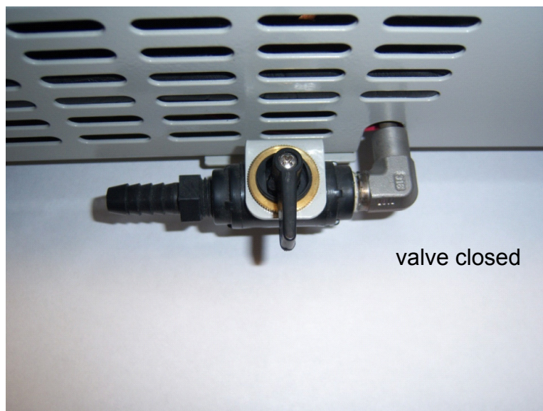
Figure 7. Drain valve closed

To reuse CryoCool that has a layer of water, transfer it to a container and allow to settle again into a bilayer. Place in a freezer until the water layer freezes. The liquid fraction is CryoCool, which can be reused. Decant off the CryoCool and dispose of the ice.