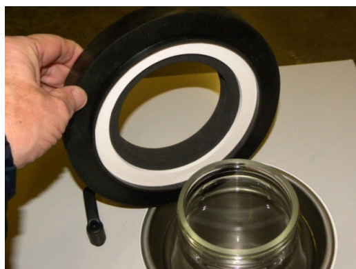
Figure 3. GF4000 with insulation ring

The following figures illustrate GF4000 condensation flask installation.