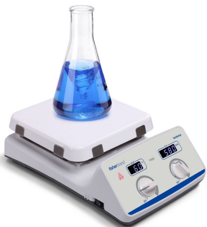
Isotemp Stirring Hotplate

Your Isotemp model may be used for general purpose heating applications and/or general laboratory mixing of solutions, including sample preparation, heating reagents, melting paraffin, warming resinous chemicals, content analysis, solvent evaporations, digestions, media preparation and sterilization, titrations, sand baths, and microscale chemistry application.