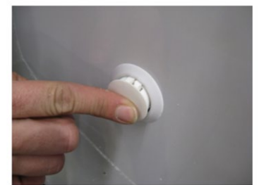
Exterior plug example