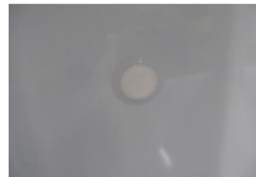
Interior plug example: